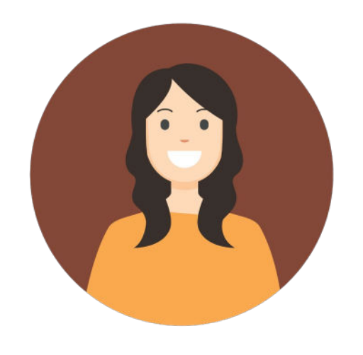
Expanding Your Network