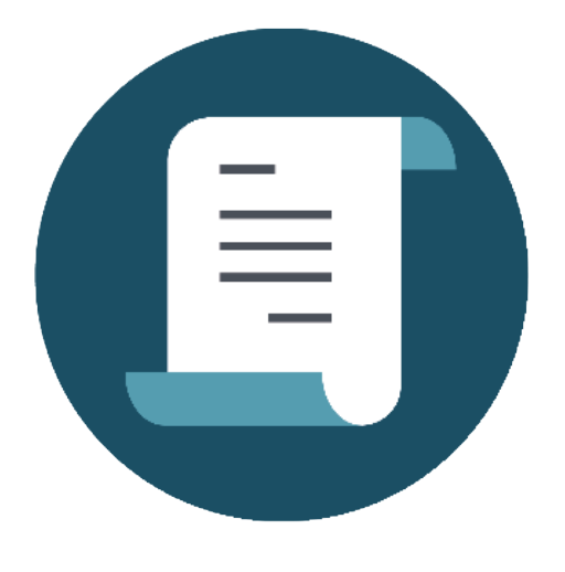
Building Your Resume