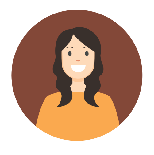
Expanding Your Network